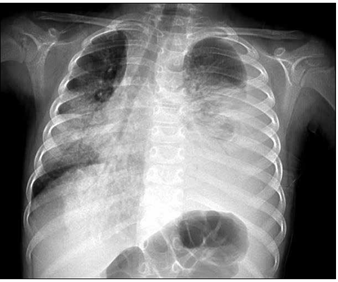
Figure 1. Consolidation in the right lung middle zone and in the left lung that extends to the apex, pleural effusion in the left lung.

ter of the patient, who was given two doses of intrapleural t-PA and whose tube thoracostomy catheter was drained 470 mL of purulent fluid, was removed on admission day 9 due to the fluid drainage was terminated. While the blood culture of patient was negative, vancomycin-subceptible but penicillin, clindamycin and ceftriaxone-resistant S. pneumoniae was yielded on the pleural fluid culture of the patient. Clindamycin and oseltamivir treatment was terminated. The obtained isolate was typed/ identified as serotype 19 by swelling of the capsule (Quellung reaction) with commercial antiserum belonging to the Statens Serum Institute (Copenhagen, Denmark). On thoracic ultrasonography performed after the removal of tube thoracostomy of the patient, a 70 x 37 mm in size solid formation, involving cystic-necrotic areas within, in the left lung was monitored. A thoracic computerized tomography (CT) was performed, and an appearance compatible with an abscess, approximately 80 x 55 x 55 mm in size, with peripheral contrast involvement and levelling within in the left lung lower lobe was detected (Figure 2). The patient was consulted by the department of thoracic surgery and monitoring with antibiotic treatment was decided