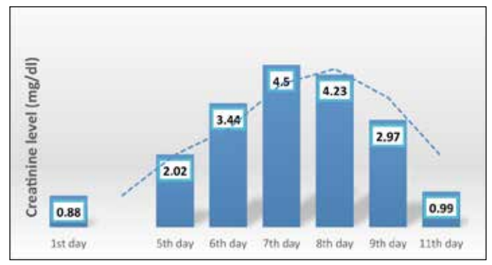
Figure 1. Creatinine change chart for eleven days.