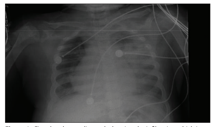
Figure 1. First day chest radiograph showing the infiltration which is more pronounced in the left.