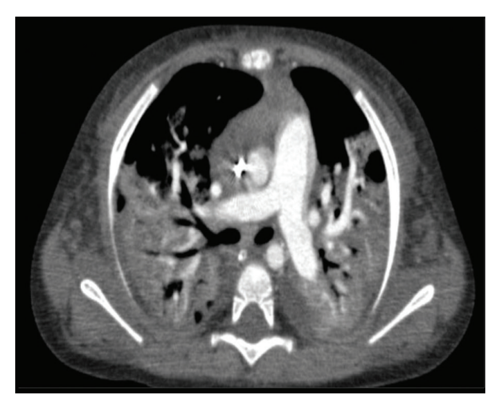
Figure 2. Pulmonary hemorrhage seen on thorax computerized tomography (CT).