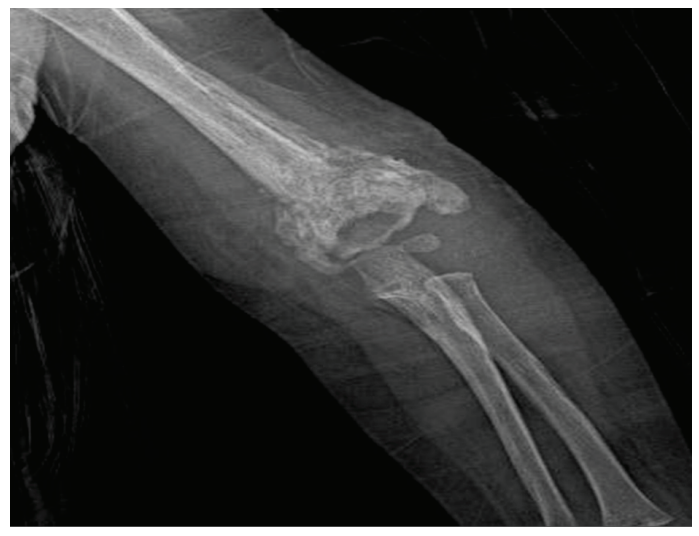
Figure 3. Periosteal reaction described in osteomyelitis seen on direct X-Ray.